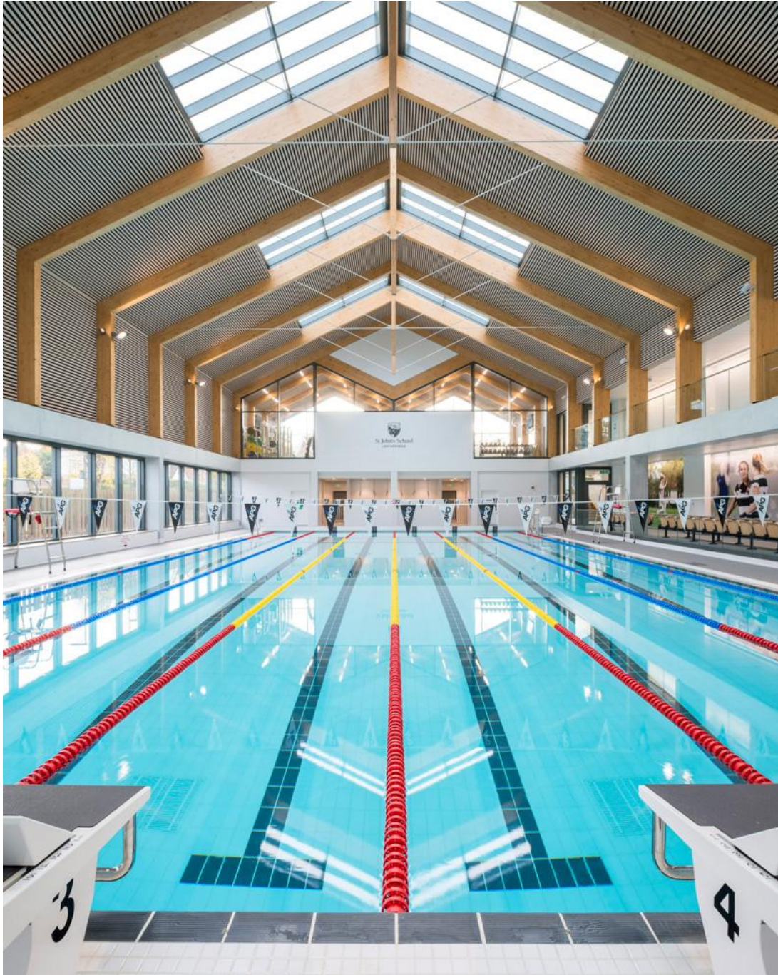
St John's School Sevenoaks (2019)