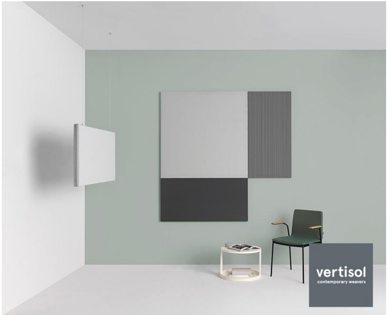
Vertisol Lessen Hexagonal, Square and Rectangular Wall Panels (2019)