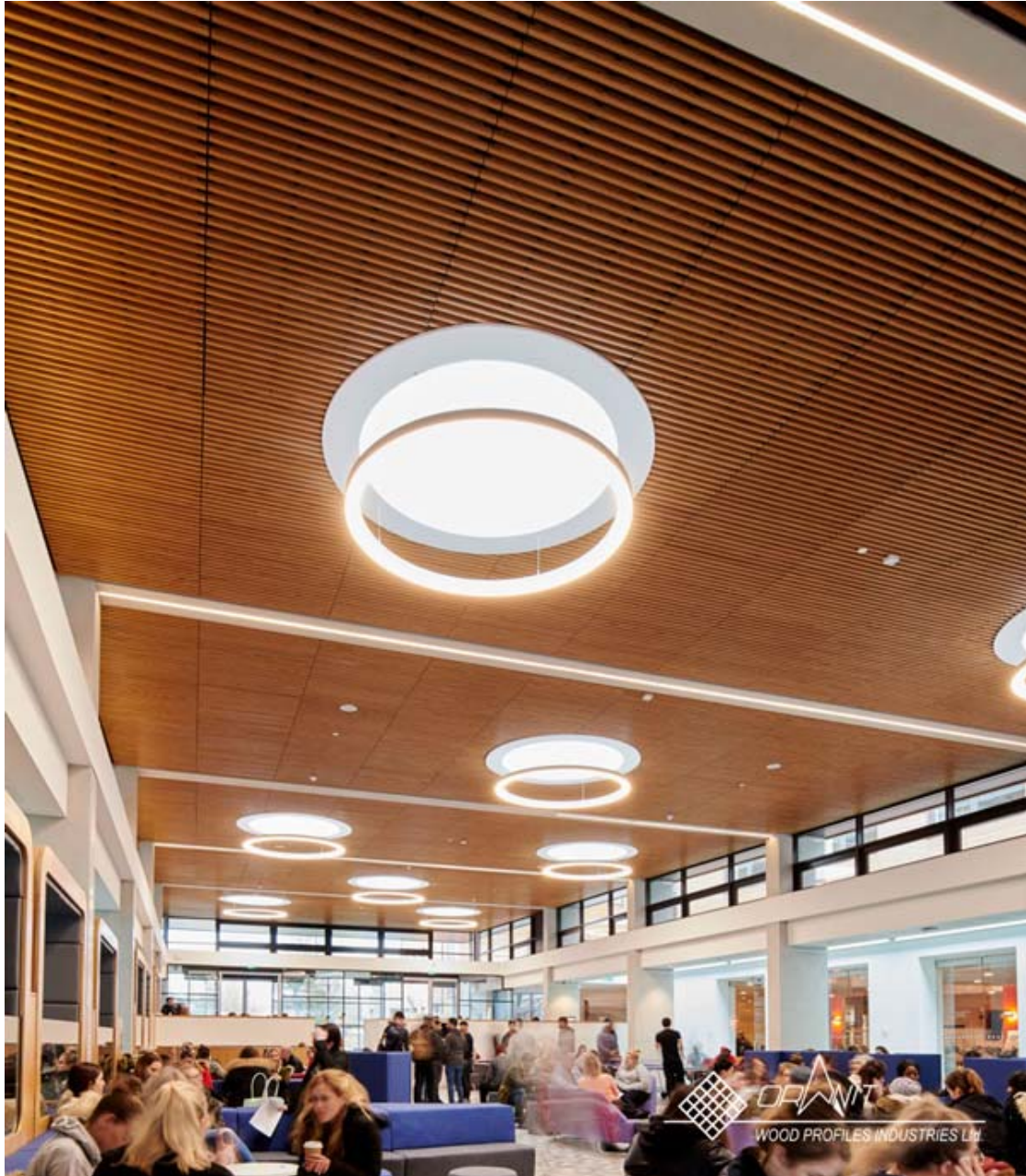
University of Central Lancashire, Foster and Hamilton Buildings. (2017)